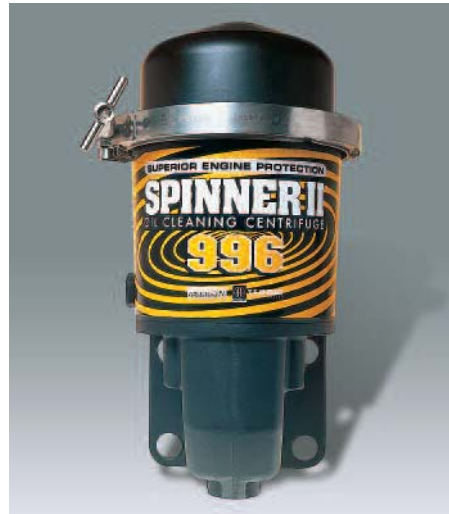
Model 996 450 L/hr (120 gall/hr)

Cleaning your centrifuge is fast and easy. Simply remove the cover, lift out the reusable bowl and remove the dry, compacted contaminants. There are no expensive filter elements to replace, and nothing to drain, crush or haul away. Many Spinner II users examine the solid contaminants to diagnose engine conditions.